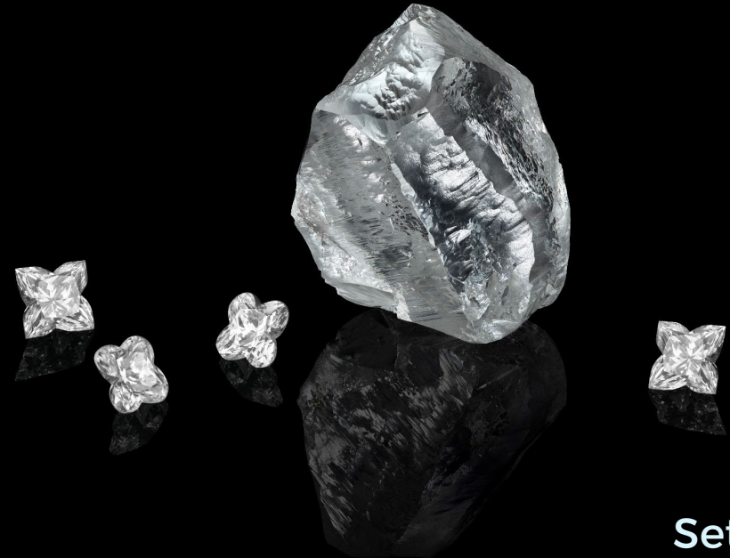
Sethunya, 549 carats

Revenue from shipments in 2020 and 2021 continue to be recognized