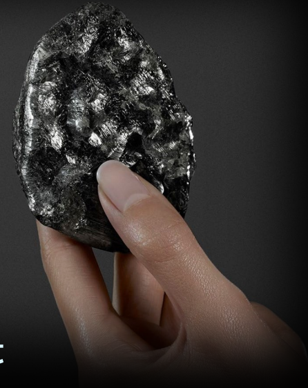
1,758 ct Sewelô