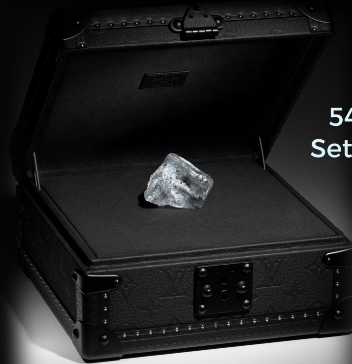
549 ct Sethunya

Lucara will participate in all sales of polished diamonds resulting from the Sethunya and 50% of polished sales resulting from the Sewelô with a further commitment from LV to contribute 5% of all Sewelô retail jewelry sales towards community-based initiatives in Botswana