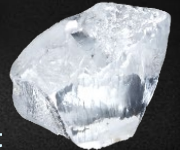
549 ct Sethunya