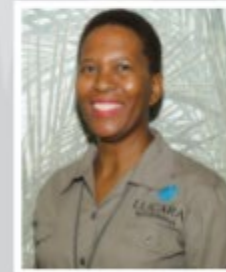
Tiny Tape Grade Control Geologist