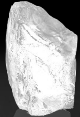
813 ct Constellation